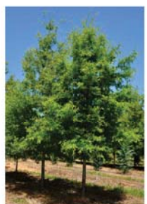
QP: QUERCUS PHELLOS (WILLOW OAK) NORTH FAIRFAX DRIVE