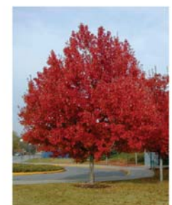
AM: ACER RUBRUM (RED MAPLE) NORTH QUINCY STREET