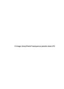
QS: QUERCUS PALUSTRIS (PIN OAK) NORTH RANDOLPH STREET