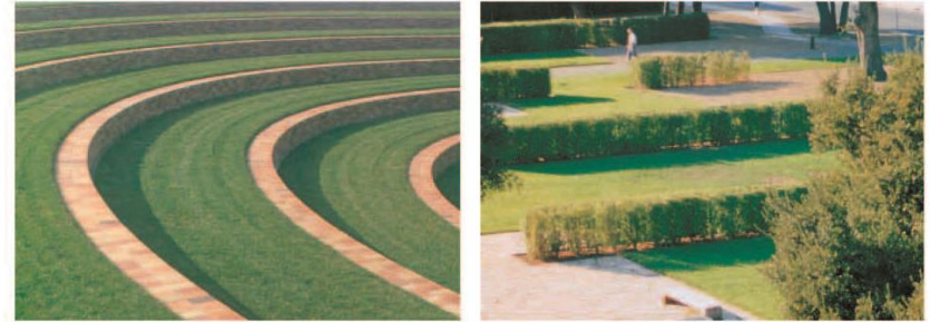
Open space with varied landscape styles to match the activities. Terraced for seating and outdoor concerts in the park, organized to break down the scale of the buildings.