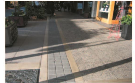
Varied textures of paving add character and scale for pedestrians.