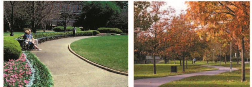
Provide large open space with trees, shrubs, grass, seasonal color.