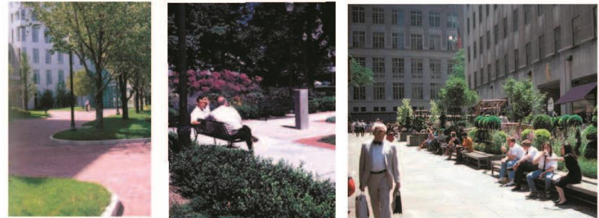
Seating and walkways with landscaped area to provide variety throughout the site to complement the projects design and pedestrian use.