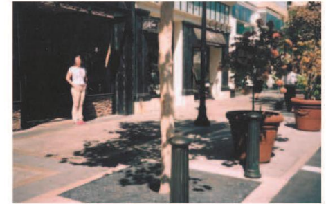
Tree grates and street trees with sidewalk paving