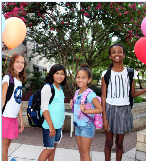
AHC Afterschool Program