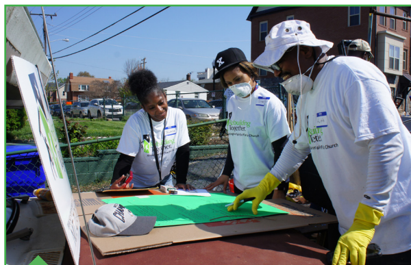
Rebuilding Together Volunteers