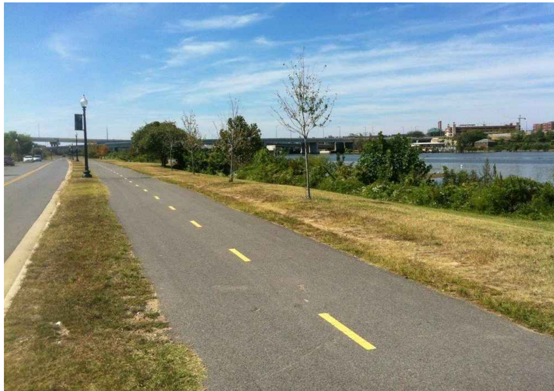
10 ft-wide Sidewalks & Shared Use Paths