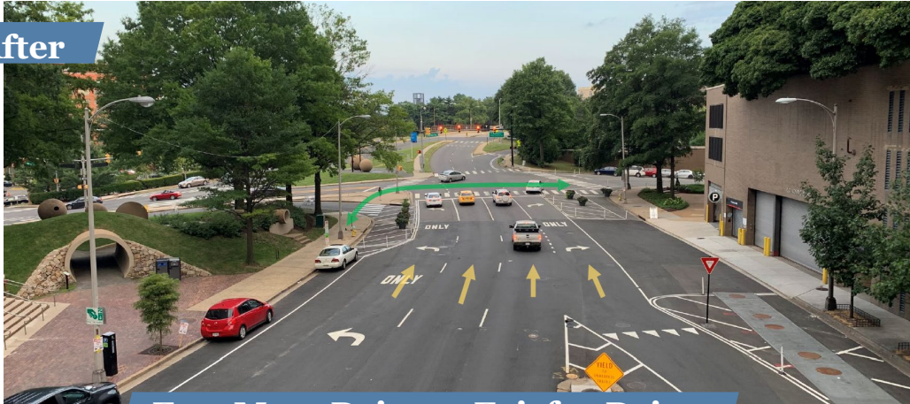
Fort Myer Drive at Fairfax Drive