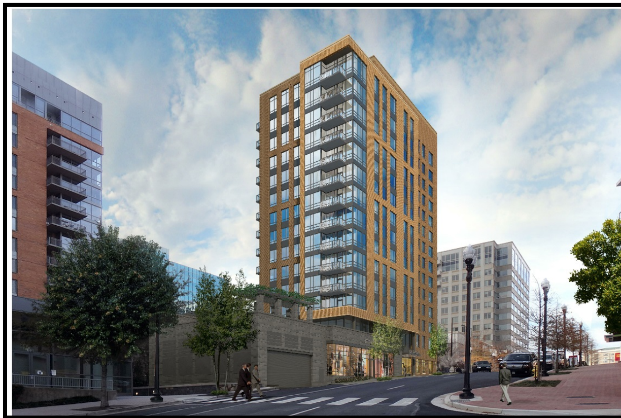
Figure 2—Clarendon Boulevard elevation